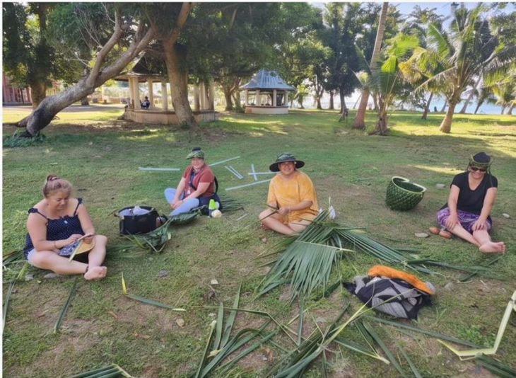
Moments from Lam Family Reunion 2023